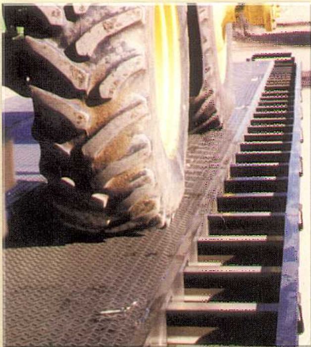
53' Dropdeck, spread axle with