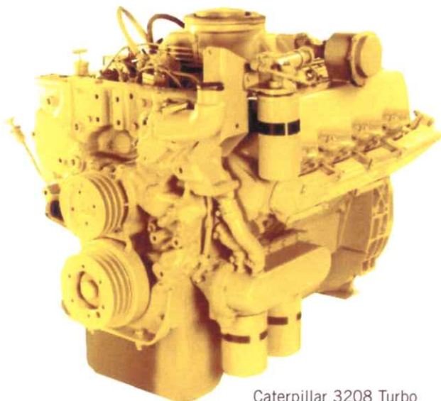
Caterpillar 3208 Turbo