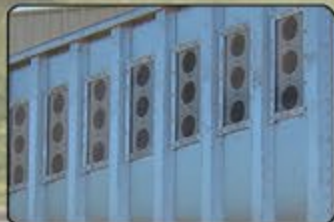
Aluminum Vent Covers