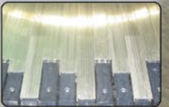
Hallco or Keith Moving Floors