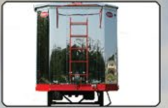
18" Diagonal Front Design