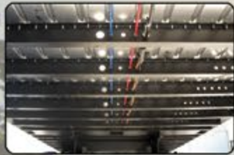
Wax Coated Floor Sills