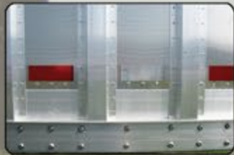
Extruded Aluminum Lower Rail