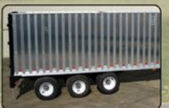
Multiple Axle Configurations