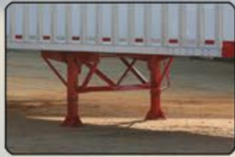
Heavy Duty 2-Speed Landing Gear

In 1911, the folks in Elba, Alabama set out to build the most durable custom trailers on the market. Today, Dorsey's vision remains the same.