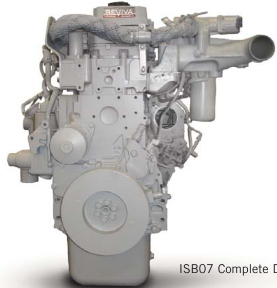
ISB07 Complete Drop-In

All of Reviva's Complete Drop-In engines are 100% dyno tested prior to shipment. Computer controls ensure that each engine dyno test is conducted under standard, repeatable settings. Every engine is run through a warm up cycle; three separate cruise segments simulating light, medium and heavy throttle conditions; maximum torque and horsepower tests; both high and low idle tests; and a black light leak detection test with dyed oil, coolant and fuel.