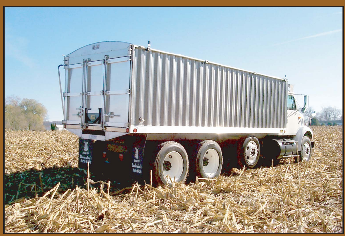
Aluminum Farm Grain Body

210 Regent Street, PO Box 400 Guttenberg, IA 52052 PHONE (563) 252 2035 FAX (563) 252 3069 E-MAIL sales@kannmfg.com WEB www.kannmfg.com