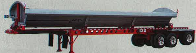
No Center Divider, Trunnion Mounted Inverted Cylinder and External Supports provide for unprecedented Side Dump stability.