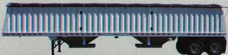
Aluminum Grain Hopper Trailers - 34', 38', 40' & 42'