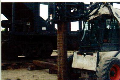
Drives railroad ties and guardrail posts.

The self-contained Post Driver is the choice for fencing contractors, landscapers, ranchers, farmers, and maintenance departments. Skid steer maneuverability allows the unit to be easily moved around buildings, storage sheds, trees and other obstacles, with minimal hydraulic power. Powered by a minimum of 10 GPM, the Post Driver can drive a 4" to 5" post into the ground in less than 15 seconds.