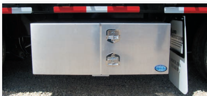
Aluminum Tool Box