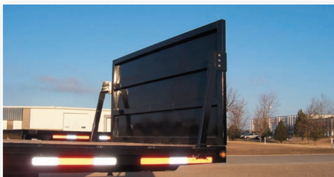
Front Bulkhead (Removable)