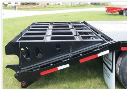
Ramp Designed to Carry Extra Cargo