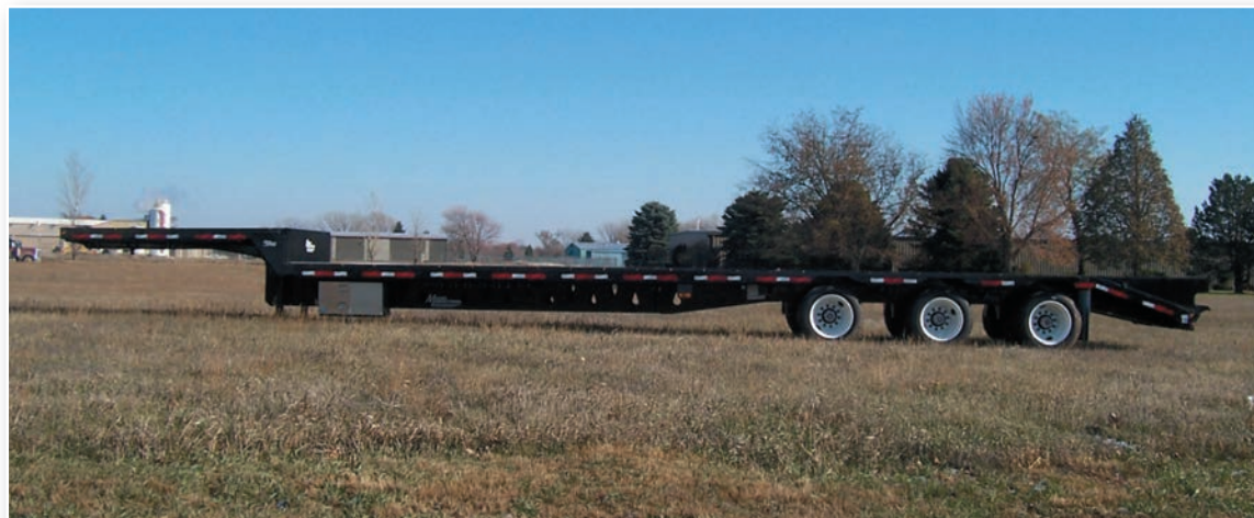
Air Ride Suspension Standard on Triple Axle Trailers