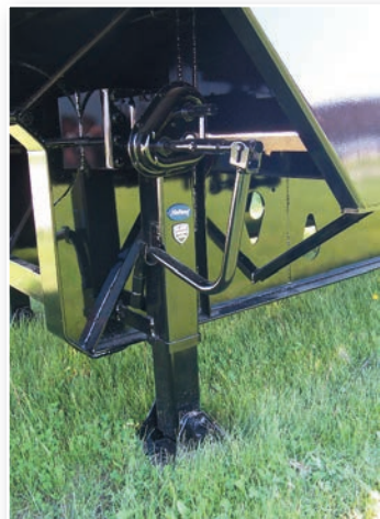
Holland Atlas 55 Landing Gear