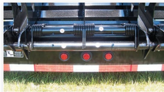
Spring Assisted Ramps