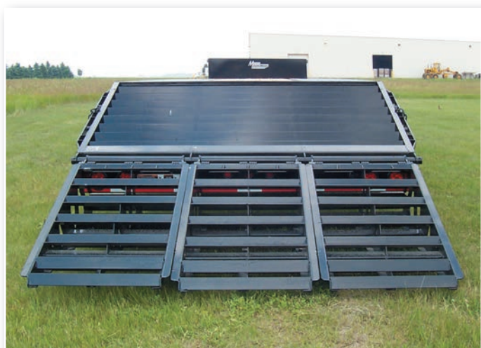
Beaver Tail with 3 Ramps