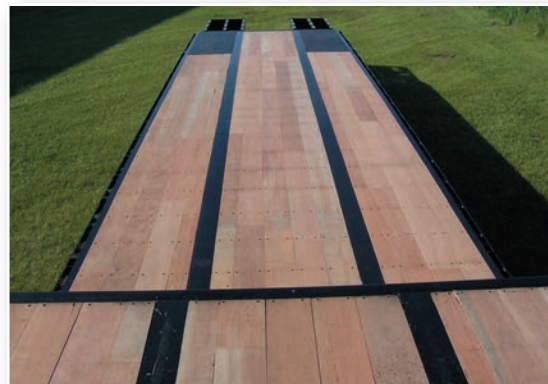
Apitong Flooring (screwed to every cross member)