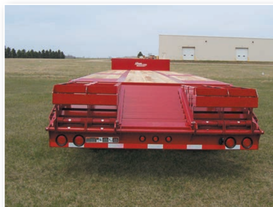
Twin Ramps Standard on Beaver Tail Trailer