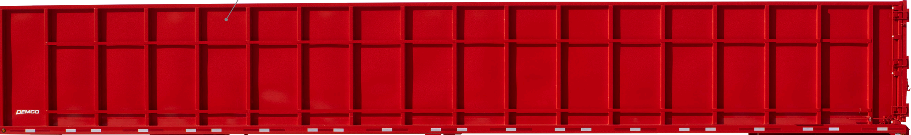
DOT APPROVED CONSPICUITY TAPE