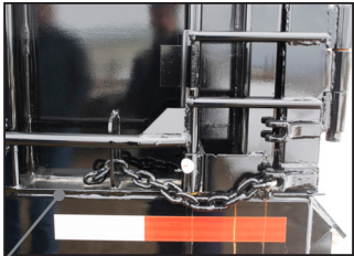
SAFETY DOOR OPENER The safetydoor opener is optional for the Latch closure