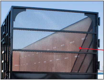
VENTED TAIL GATE Optional vented tail gate