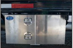
TOOLBOX Aluminum body