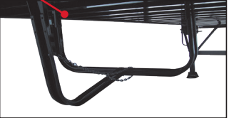
SPARE TIRE CARRIER