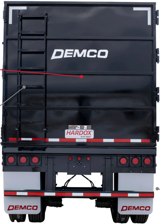
HINGES New mounting of hinges to better align the rear door